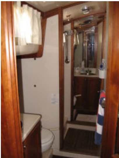
two heads with separate shower