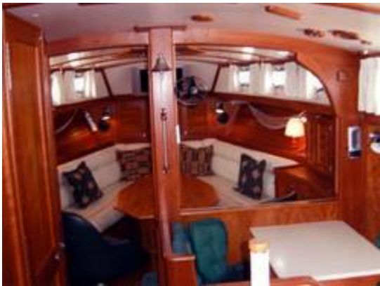
Dinette and Main Saloon