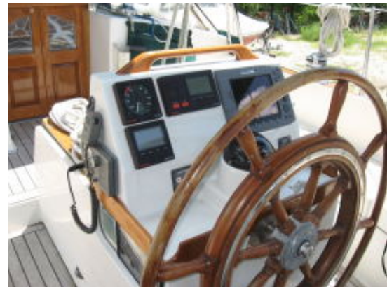
new helm pod