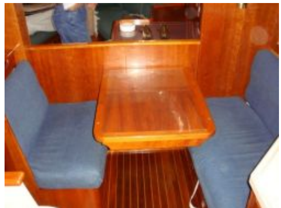
settee w/slip covers on